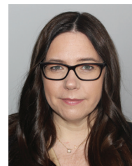
Elizabeth Mahony Commissioner MA Department of Energy Resources